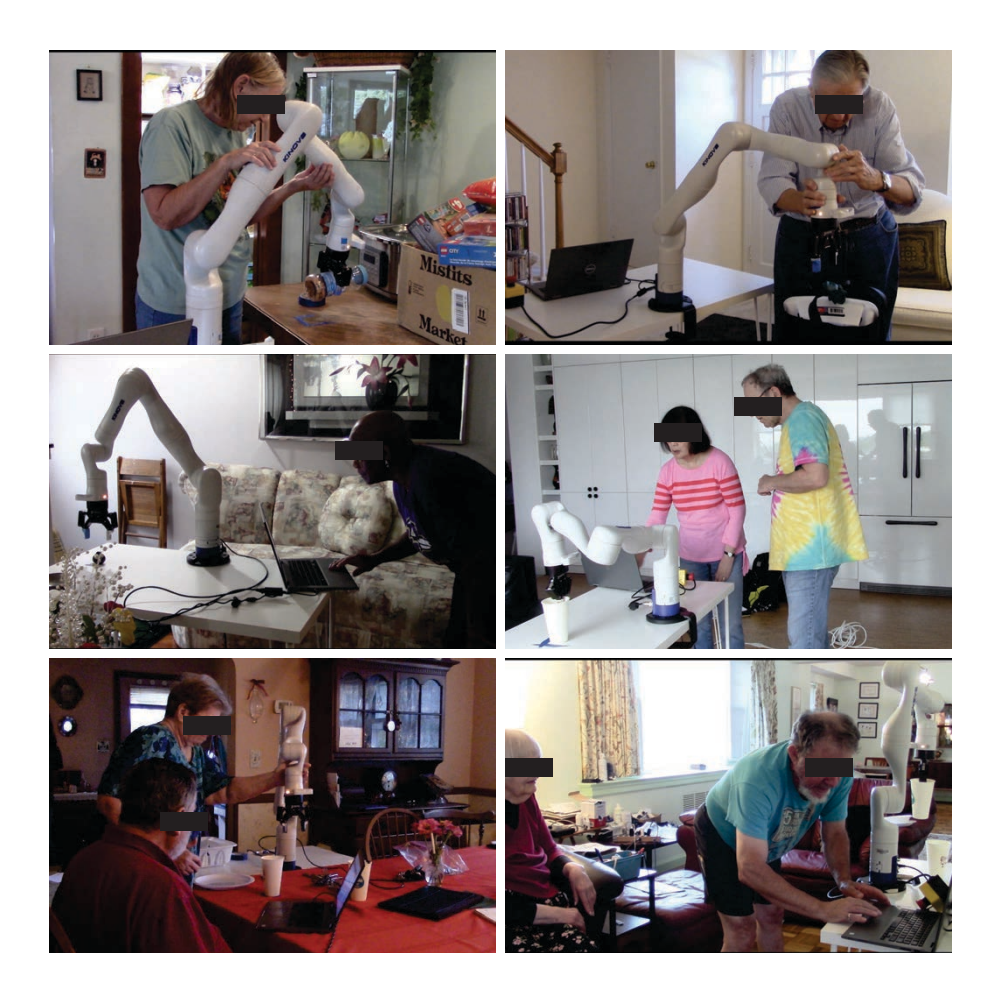
Figure 1: We observed older individuals' and couples' experiences in programming a contemporary robot arm to assist with household tasks, such as handling food, loading a dish rack, or retrieving a grocery bag.

adults at their homes to better understand what factors shape their perceptions of programming robot assistance, including affective and aesthetic factors particular to home-based technologies [13]. Our work aims to understand older adults' perspectives as prospective users within the contexts of their homes, while also eliciting design feedback on how contemporary robot programming methods may need to evolve to maximize usability and accessibility for older adults.