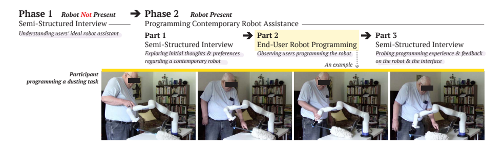
Figure 2: Our study procedure consisted of two phases. In Phase 1, we conducted a semistructured interview to understand older adults' ideal robot assistance. In Phase 2, we explored users' thoughts, experiences, and feedback regarding programming a contemporary robot arm to perform household tasks such as dusting.

We conducted study sessions in participants' residences. All participants in our study lived in houses or condos that they owned, and their residences were not part of senior communities. Single-story and multi-story homes with and without outdoor properties were included in the study.